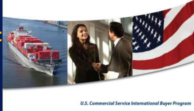
U.S. Commercial Service International Buyer Program

As a member of an official U.S. Embassy Delegation to IBP Trade Shows, you receive access to exclusive benefits, including :